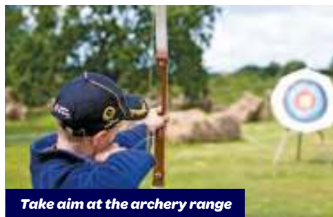
Take aim at the archery range