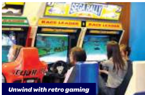
Unwind with retro gaming