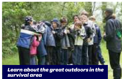
Learn about the great outdoors in the survival area