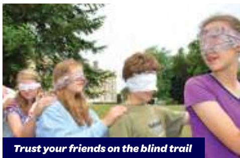
Trust your friends on the blind trail