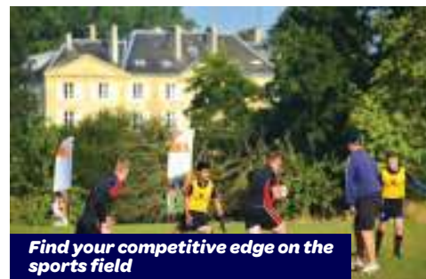
Find your competitive edge on the sports field