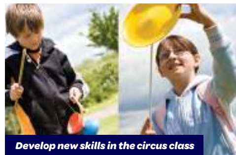
Develop new skills in the circus class