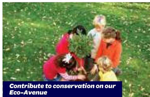
Contribute to conservation on our Eco-Avenue