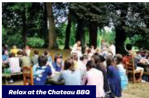
Relax at the Chateau BBQ