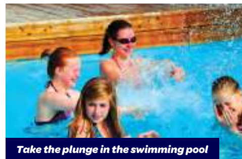
Take the plunge in the swimming pool