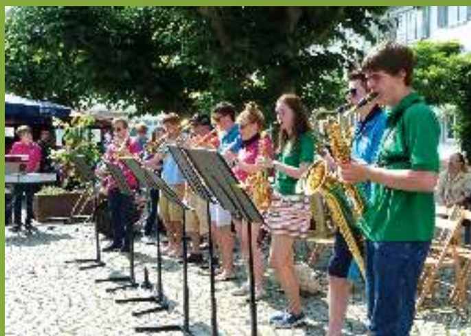
Music and Concert Tours