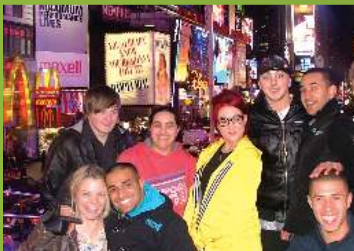
College and University Tours