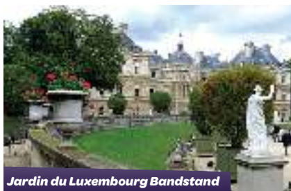
Jardin du Luxembourg Bandstand

This neoclassical building resembling a Roman Temple was intended as a monument to Napoleon's Grande Armée. Charles-Camille Saint-Saëns and Gabriel Fauré have both been organists here. Music plays a central role in the church's activities and visiting choirs and orchestras are warmly welcomed.