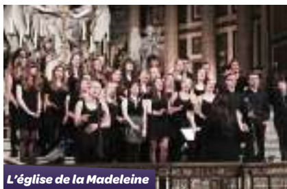
L'église de la Madeleine

This neoclassical building resembling a Roman Temple was intended as a monument to Napoleon's Grande Armée. Charles-Camille Saint-Saëns and Gabriel Fauré have both been organists here. Music plays a central role in the church's activities and visiting choirs and orchestras are warmly welcomed.