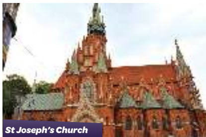
St Joseph's Church

The spa town of Rabka became known after WWI as a healing centre for children affected by tuberculosis. During WWII, it was occupied by the Nazis and became the holiday centre for German children from bombed cities. Performances can be arranged in the covered amphitheatre in the spa gardens.