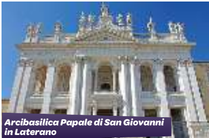
Arcibasilica Papale di San Giovanni in Laterano

One of 4 Papal basilicas in Rome, this is the most important Roman Marian church in the city, dedicated to worshipping the Blessed Virgin Mary. Choirs are invited to sing during Mass.