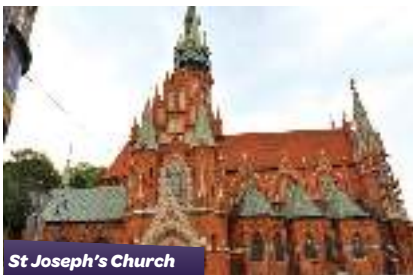
St Joseph's Church

The spa town of Rabka became known after WWI as a healing centre for children affected by tuberculosis. During WWII, it was occupied by the Nazis and became the holiday centre for German children from bombed cities. Performances can be arranged in the covered amphitheatre in the spa gardens.