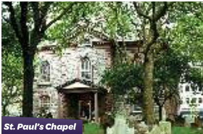
St. Paul's Chapel

Affectionately known as 'Big John' amongst the locals, this is the 4th largest Christian church in the world. It's so large that it is over 2 football fields long and so tall that the Statue of Liberty would comfortably fit under its dome! The cathedral is famous for its 8 second reverberation.