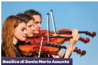
Basilica di Santa Maria Assunta

This sought-after professional venue is one of the most famous and historical spa establishments in Montecatini, dating from the 18th century. Its spectacular colonnade is a fantastic backdrop for any type of concert.