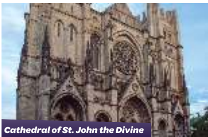
Cathedral of St. John the Divine

Affectionately known as 'Big John' amongst the locals, this is the 4th largest Christian church in the world. It's so large that it is over 2 football fields long and so tall that the Statue of Liberty would comfortably fit under its dome! The cathedral is famous for its 8 second reverberation.