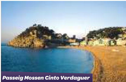
Passeig Mossen Cinto Verdaguer

One of Spain's most imposing Gothic buildings – with its roof renowned for its gargoyles, depicting both mythical and domestic animals – this stunning cathedral regularly hosts choirs and visiting orchestras. A very 'resonant interior' is to be expected as well as a very warm welcome.