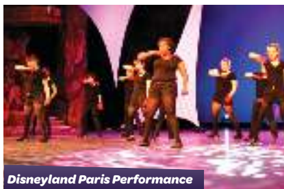
Disneyland Paris Performance

Notre-Dame Cathedral really needs no introduction, as it's widely considered one of the finest examples of French Gothic architecture in the world. Choral performances are by audition only and can take the form of either an informal recital or Mass participation.