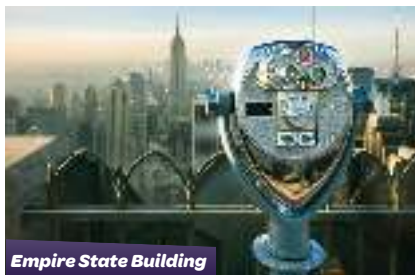
Empire State Building

Opened in 1766, St. Paul's Chapel escaped destruction when the World Trade Center buildings collapsed on September 11, 2001 and it now plays a vital role in telling the 9/11 story. More than one million people visit the chapel every year. Performances take place everyday at 1pm.