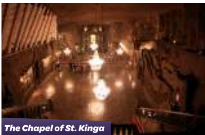
The Chapel of St. Kinga

Located on the Royal Route to the Wawel Castle and built between 1597-1619, this was the first Baroque Church in Kraków. Its opulent interior and excellent acoustics make it very popular for choral and orchestral performances.