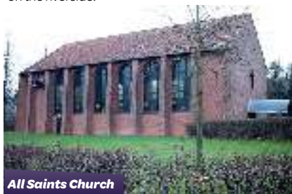
All Saints Church

A fine example of the spa days of the town, the spa house here offers a pillared and opulent setting for any concert. Emperors, Kaisers and Kings have entertained and been entertained in the grand Marble Hall. More informal performances can be arranged at the bandstand in the lush gardens right on the riverside.