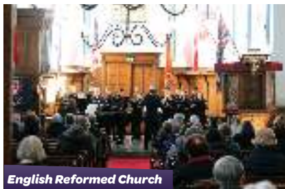
English Reformed Church

The local Protestant church in this picturesque Dutch village north of Amsterdam invites groups of any type to perform and always provides a warm welcome. Make sure you take time to explore the village with its uniquely-shaped houses.