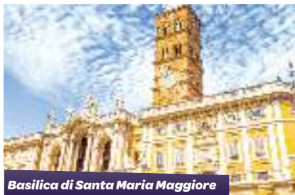
Basilica di Santa Maria Maggiore

Choirs are invited to perform during the opening times of the monument and a sacred programme is required. Thanks to its circular shape and round opening in the dome, this venue has very interesting acoustics. The 2,000 year old dome is still the largest unreinforced concrete dome in the world.