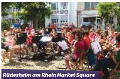
Rüdesheim am Rhein Market Square

Groups can perform on the revolving stage either indoors or outdoors. The stage is slightly smaller if groups perform outside. A piano, chairs and microphones are available for the group upon request.