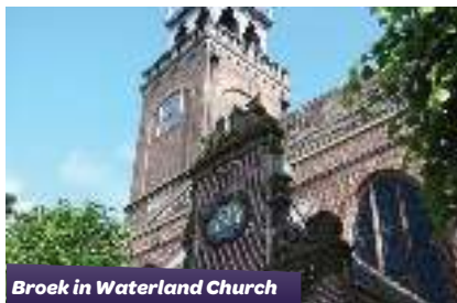
Broek in Waterland Church

This large square in Delft takes its name from the livestock markets that used to take place here from 1595 to 1972. Nowadays it is busy with cafés and restaurants. Performances take place at lunchtime in the summer months.