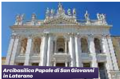
Arcibasilica Papale di San Giovanni in Laterano

One of 4 Papal basilicas in Rome, this is the most important Roman Marian church in the city, dedicated to worshipping the Blessed Virgin Mary. Choirs are invited to sing during Mass.