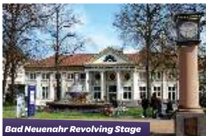
Bad Neuenahr Revolving Stage

Groups can perform on the revolving stage either indoors or outdoors. The stage is slightly smaller if groups perform outside. A piano, chairs and microphones are available for the group upon request.