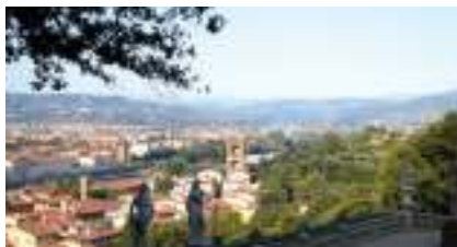
Chiesa di Santa Margherita in Santa Maria dei Ricci

This lovely church holds regular concerts for both amateur and professional ensembles to finance the maintenance of the organ. Extremely popular with our groups, this is a small, intimate venue right in the heart of Florence.