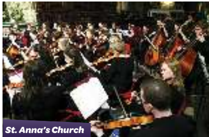
St. Anna's Church

The building of Prague Hlahol was built in 1905 for choir rehearsals. Architectonically, the building is considered to be one of the finest Art Nouveau monuments of its kind. A piano, changing rooms and toilets are available in this concert hall for the group.