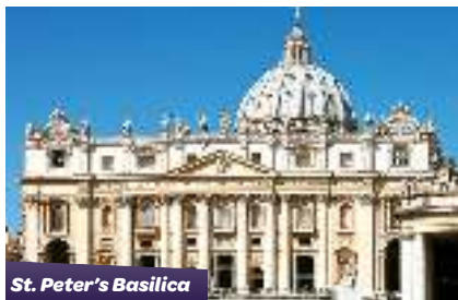
St. Peter's Basilica

Would your choir love to sing at Mass in the most venerable church in the Catholic world? St. Peter's Basilica is possibly the most notorious work of Renaissance architecture and one of the world's largest churches. Be prepared for imposing acoustics in this church in Vatican City.