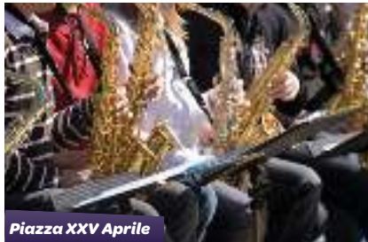
Piazza XXV Aprile

In a prominent location in the town of Garda, right on the lakeside promenade, this is a professional amphitheatre with tiered seating for the audience. Evening concerts are incredibly popular with locals and tourists alike.