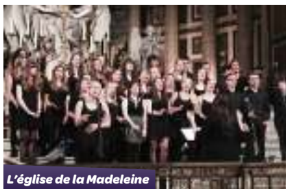
L'église de la Madeleine

This neoclassical building resembling a Roman Temple was intended as a monument to Napoleon's Grande Armée. Charles-Camille Saint-Saëns and Gabriel Fauré have both been organists here. Music plays a central role in the church's activities and visiting choirs and orchestras are warmly welcomed.