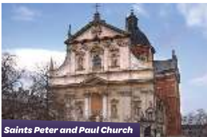
Saints Peter and Paul Church

Located on the Royal Route to the Wawel Castle and built between 1597-1619, this was the first Baroque Church in Kraków. Its opulent interior and excellent acoustics make it very popular for choral and orchestral performances.