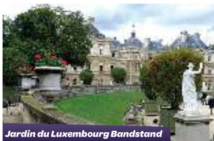
Jardin du Luxembourg Bandstand

This neoclassical building resembling a Roman Temple was intended as a monument to Napoleon's Grande Armée. Charles-Camille Saint-Saëns and Gabriel Fauré have both been organists here. Music plays a central role in the church's activities and visiting choirs and orchestras are warmly welcomed.